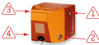
Generator Fixing Screws

DO NOT touch or attempt to adjust these four screws. Tampering with these screws will void the warranty.