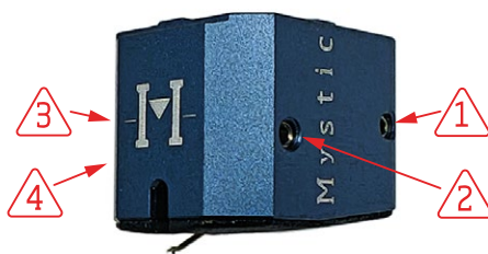
Generator Fixing Screws

DO NOT touch or attempt to adjust these four screws. Tampering with these screws will void the warranty.