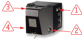
Generator Fixing Screws

DO NOT touch or attempt to adjust these four screws. Tampering with these screws will void the warranty.