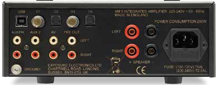
ABOVE: CD player [top] has fixed line (RCA) and digital (optical/BNC) outputs, but no digital ins. The amp [bottom] has two line inputs and MM phono plus USB-B and pairs of BNC/optical digital ins. Preamp out (RCA) is joined by 4mm speaker plug sockets

and clarity. I loved the reedy sound of the saxophone playing too. Yet there was never any undue forwardness, or any sense that the upper midband was too brightly lit. Up top, the ride cymbals had a subtly sweet sound that combined with a satisfyingly metallic zing.